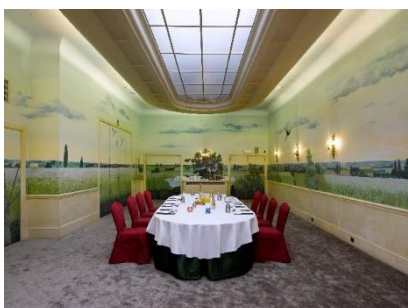
Banquet roomGulden Sporen and Vlasschaerd