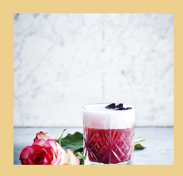
OLD & WISE - 14.00

Pergamonto liqueur - Saint Germain - Red roses syrup - Lemon juice - Cava