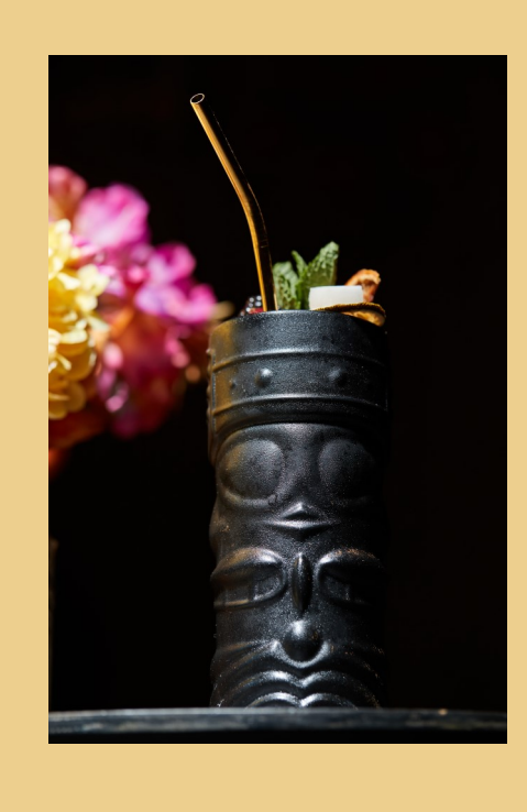
GILDED SPUR - 14.00

Whiskey - Brown Rum - Orange juice - Lime juice - Fig pure - Angostura bitters